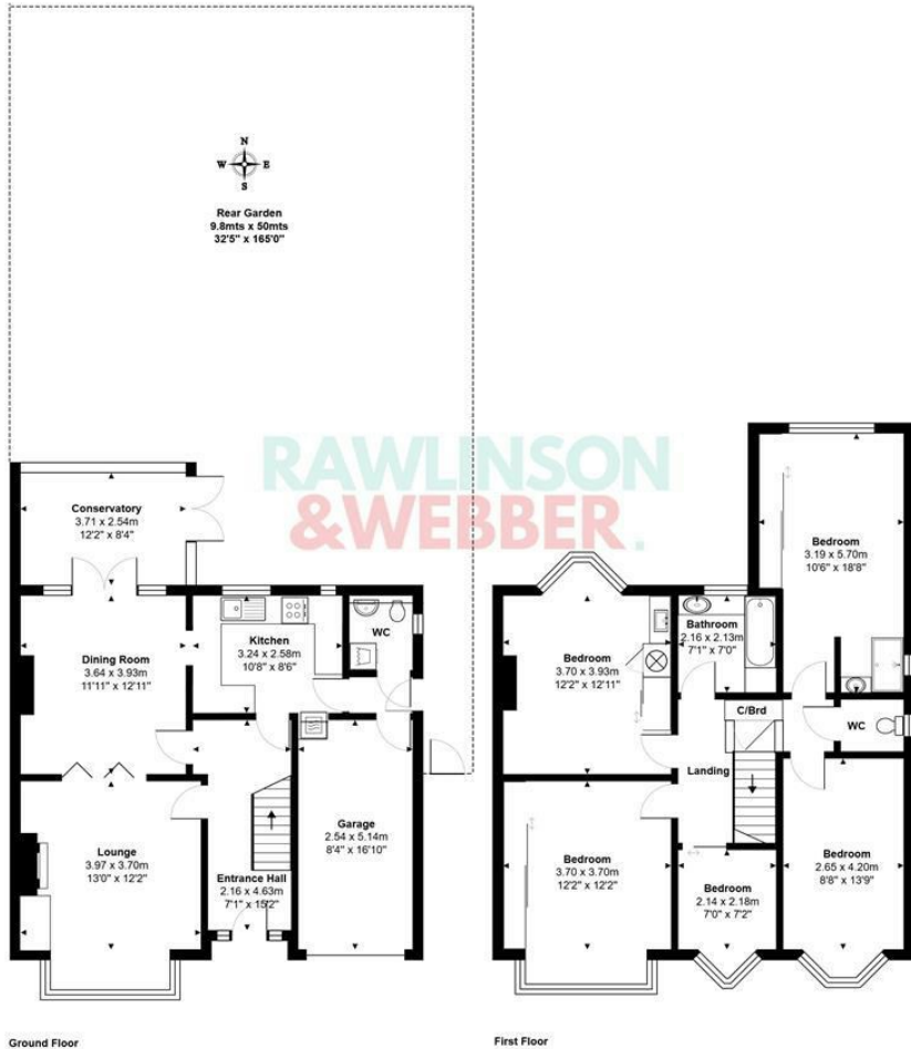
Total Area: 162.5 m 2 ... 1749 ft 2 All measurements are approximate and for display purposes only.