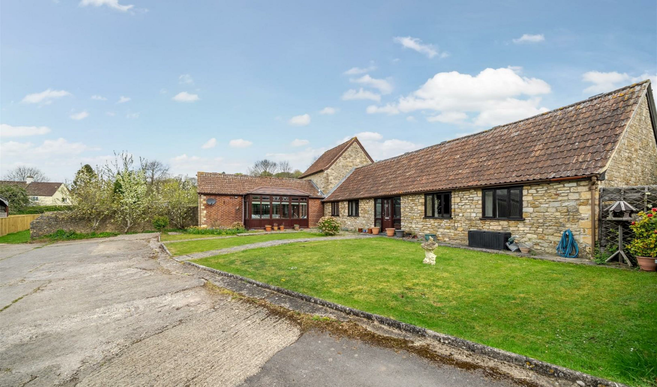
The Barn, Wotton Road, Wotton-Under-Edge, GL12 8JN Guide Price £740,000