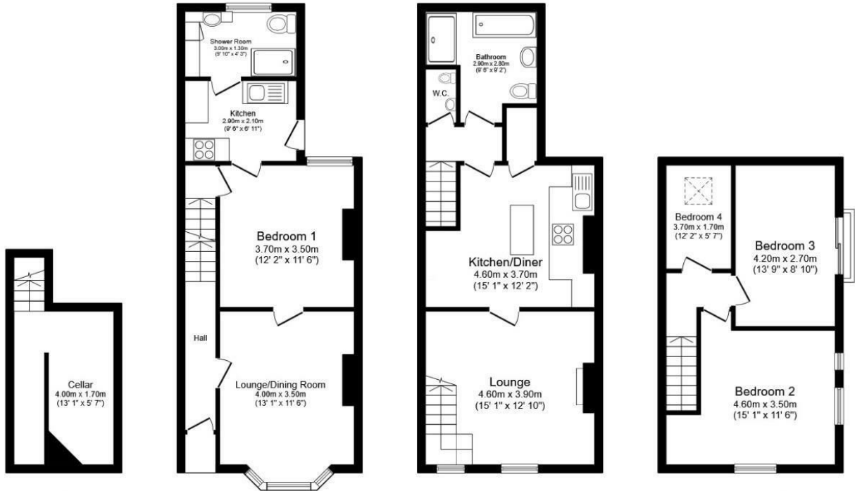
Cellar Floor area 11.5 sq.m. (124 sq.ft.)