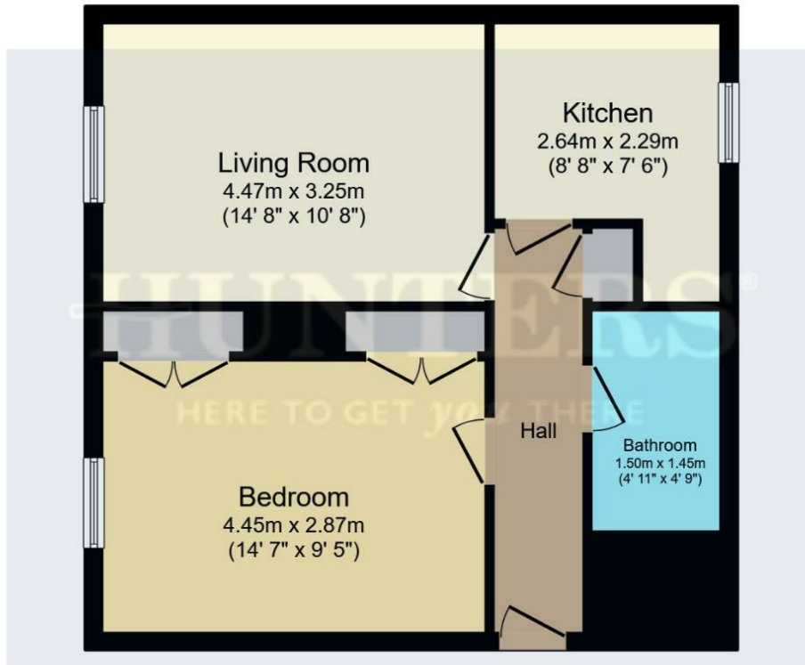
Floor Plan Floor area 51.3 sq.m. (552 sq.ft.)

Total floor area: 51.3 sq.m. (552 sq.ft.)