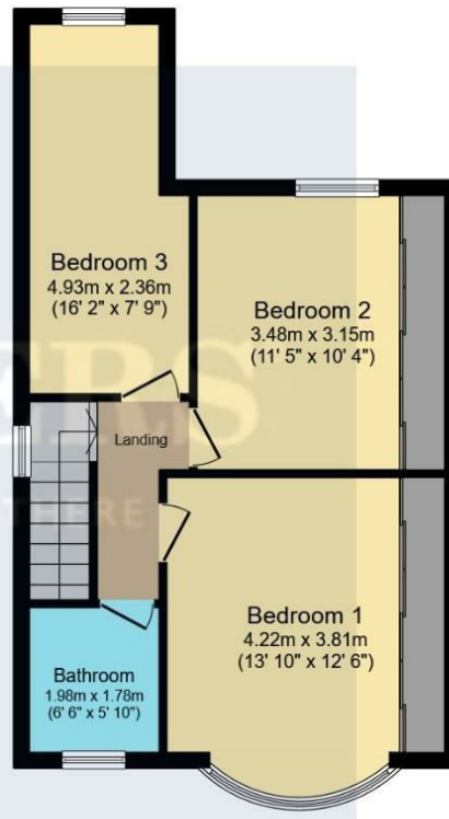
First Floor Floor area 46.2 sq.m. (497 sq.ft.)

Total floor area: 108.0 sq.m. (1,163 sq.ft.)