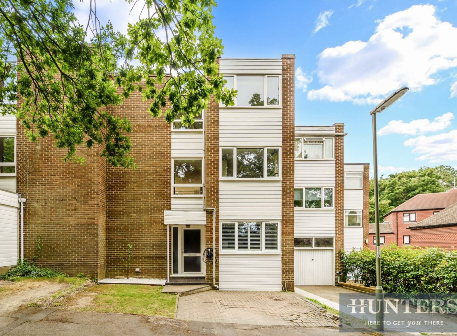
Barrow Hill Close, Worcester Park