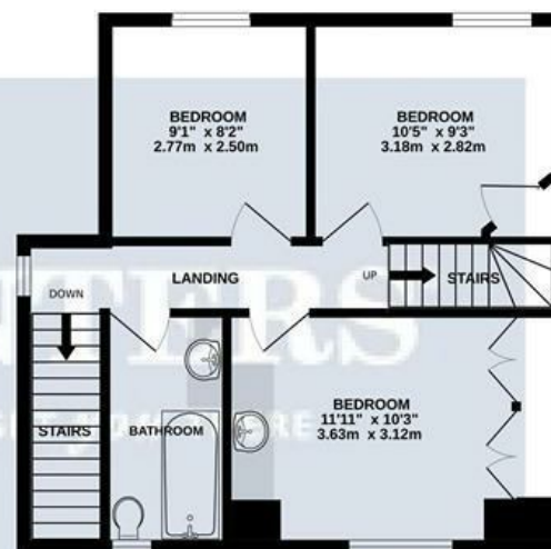
1ST FLOOR 448 sq.ft. (41.6 sq.m.) approx.