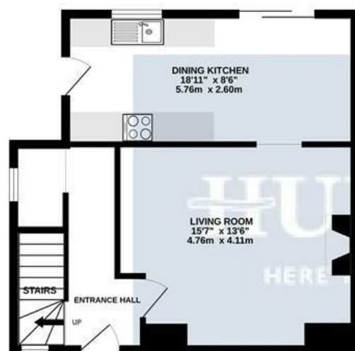
GROUND FLOOR 448 sq.ft. (41.6 sq.m.) approx.