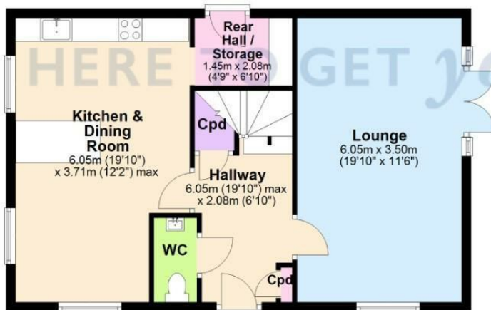
Ground Floor Approx. 57.5 sq. metres (618.5 sq. feet)