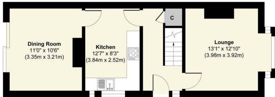
Ground Floor Approximate Floor Area 486 sq. ft (45.24 sq.m)

Approx. Gross Internal Floor Area 986 sq. ft / 91.76 sq. m