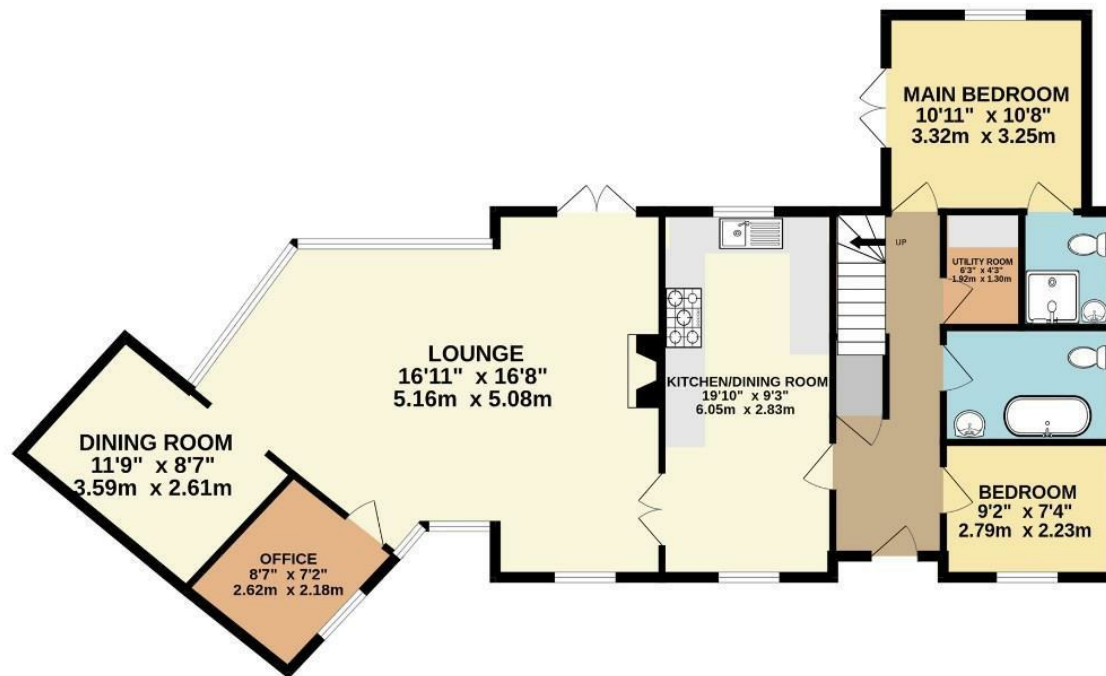
GROUND FLOOR 1130 sq.ft. (105.0 sq.m.) approx.