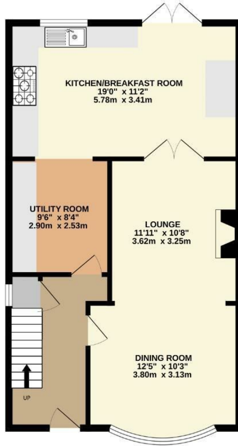
GROUND FLOOR 632 sq.ft. (58.7 sq.m.) approx.