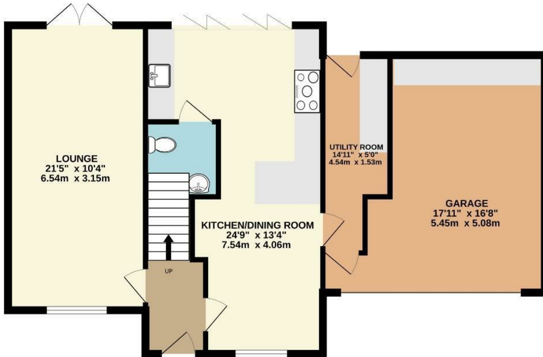
1ST FLOOR 547 sq.ft. (50.8 sq.m.) approx.