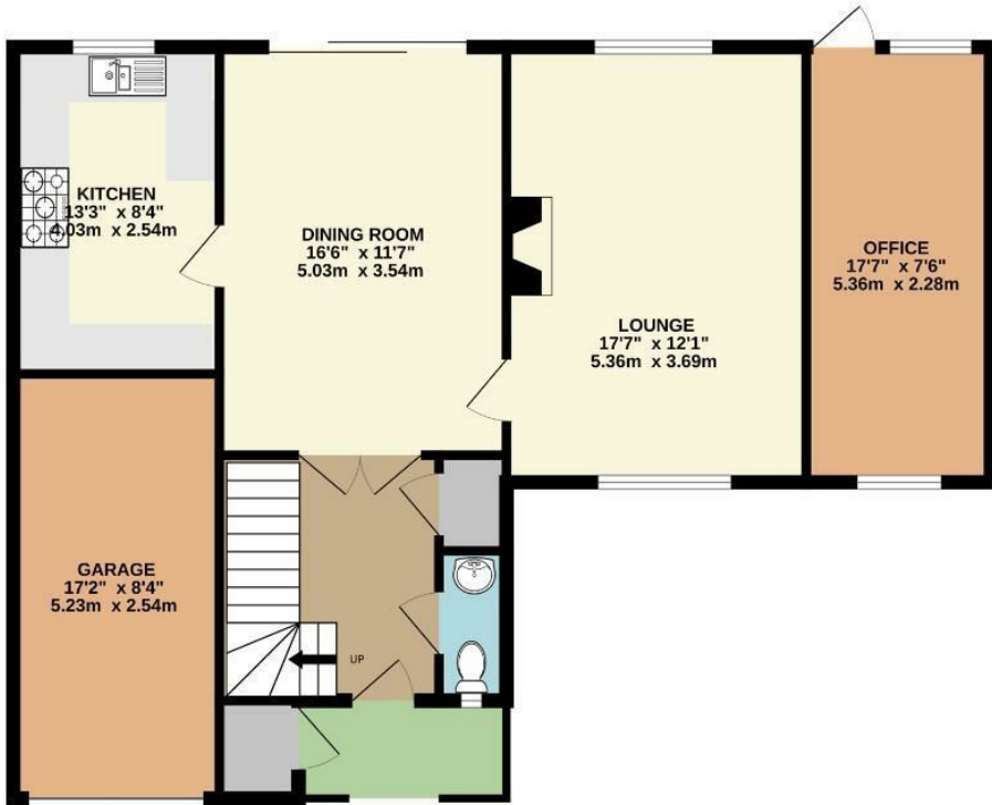
GROUND FLOOR 911 sq.ft. (84.6 sq.m.) approx.