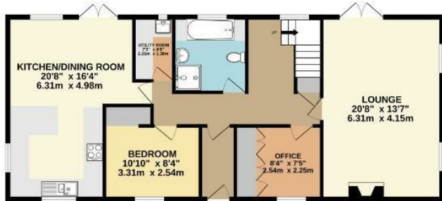
GROUND FLOOR 1011 sq.ft. (93.9 sq.m.) approx.