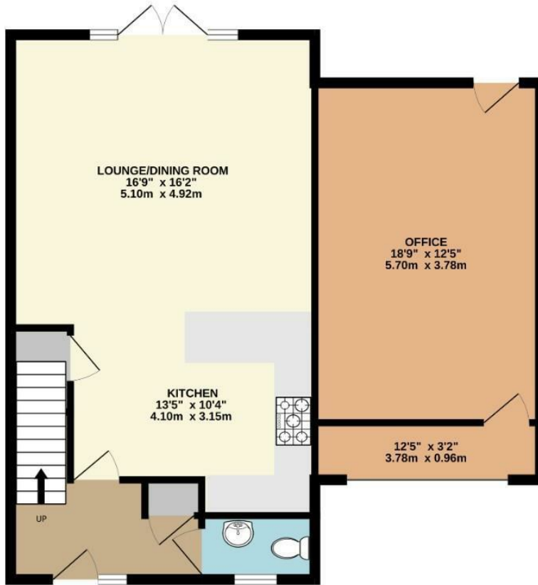
GROUND FLOOR 772 sq.ft. (71.8 sq.m.) approx.