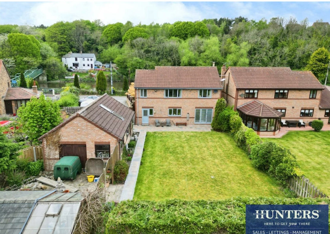
HUNTERS HERE TO GET you THERE SALES - LETTINGS - MANAGEMENT