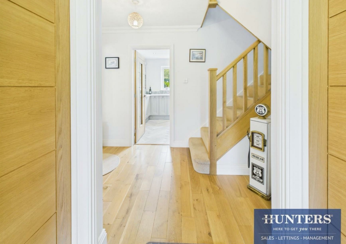
HUNTERS HERE TO GET you THERE SALES - LETTINGS - MANAGEMENT