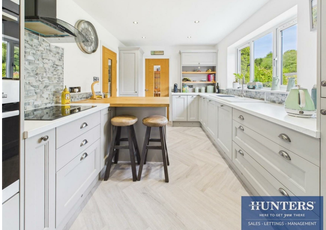
HUNTERS HERE TO GET you THERE SALES - LETTINGS - MANAGEMENT