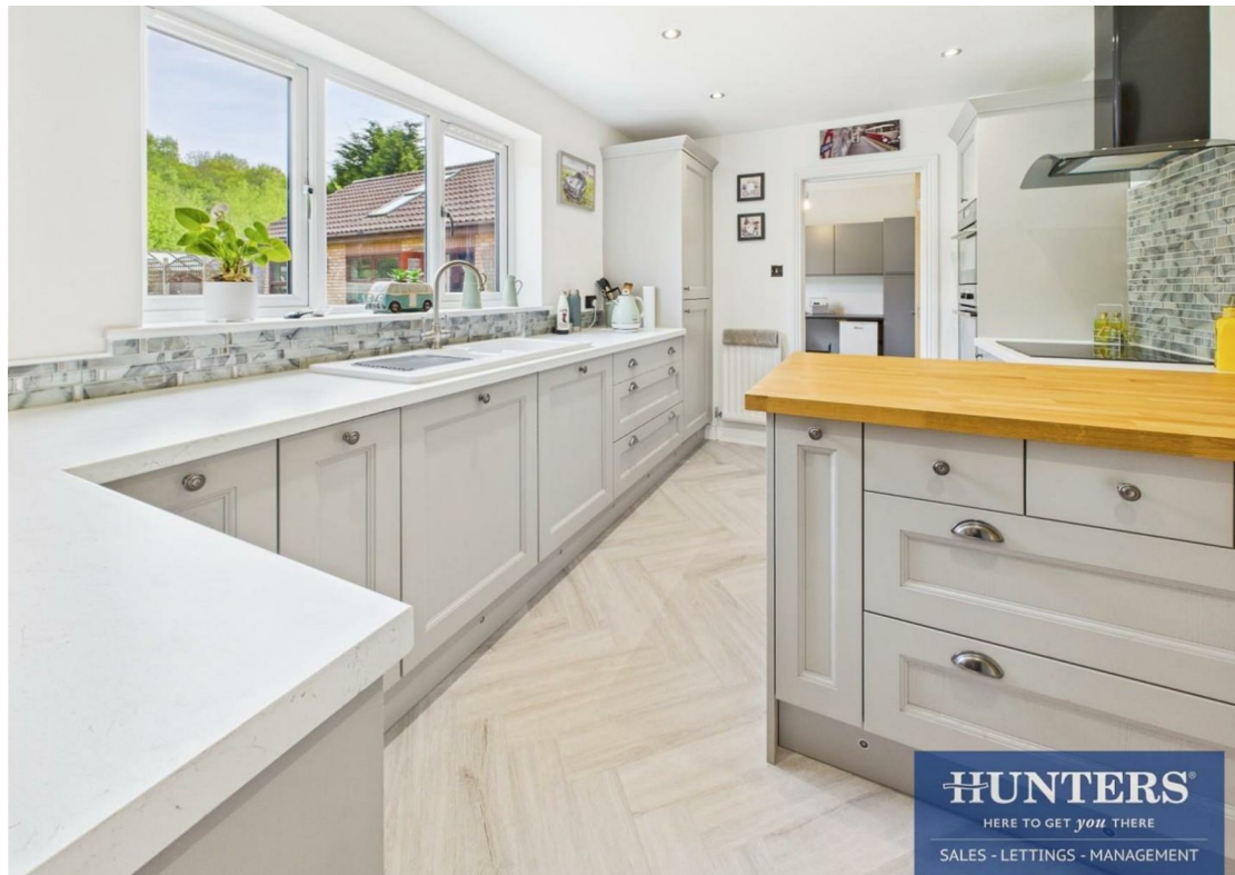
HUNTERS HERE TO GET you THERE SALES - LETTINGS - MANAGEMENT