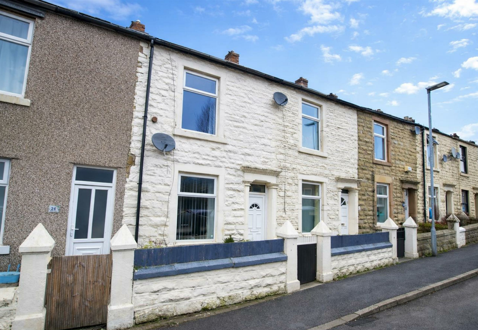
Marsh Terrace, , Darwen, BB3 0HF