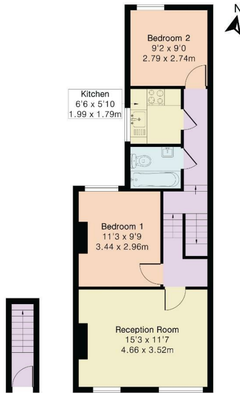
Ground Floor First Floor

Approximate Gross Internal Area 551 sq ft - 51 sq m