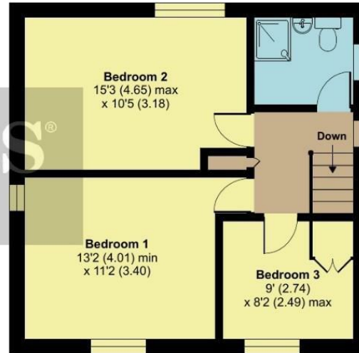
FIRST FLOOR APPROX FLOOR AREA 46.6 SQ M (502 SQ FT)