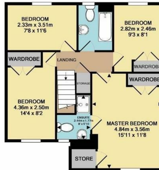
1ST FLOOR APPROX. FLOOR AREA 58.2 SQ.M. (627 SQ.FT.)

TOTAL APPROX. FLOOR AREA 130.7 SQ.M. (1406 SQ.FT.)