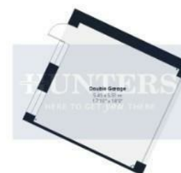
Floor 0 Building 3