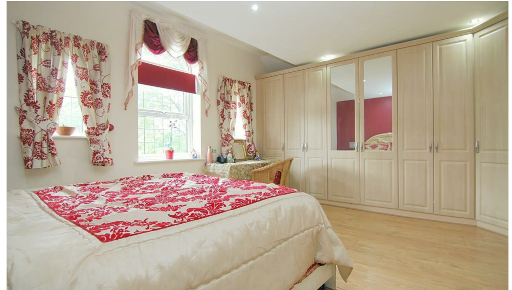
EN-SUITE 8'5" x 8'2"