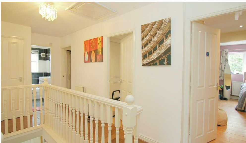
HOUSE BATHROOM 6'2" x 5'10"