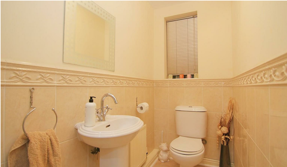
RECEPTION HALL 15'8" x 13'8"