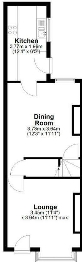
Ground Floor Approx. 38.5 sq. metres (414.1 sq. feet)