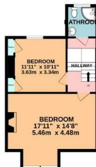
FIRST FLOOR 450 sq ft. (41.9 sq.m.) approx.