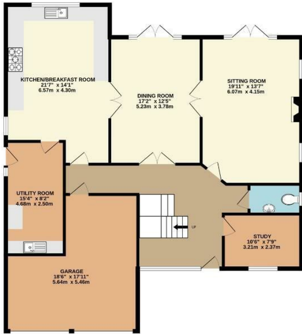
GROUND FLOOR 1349 sq.ft. (125.3 sq.m.) approx.