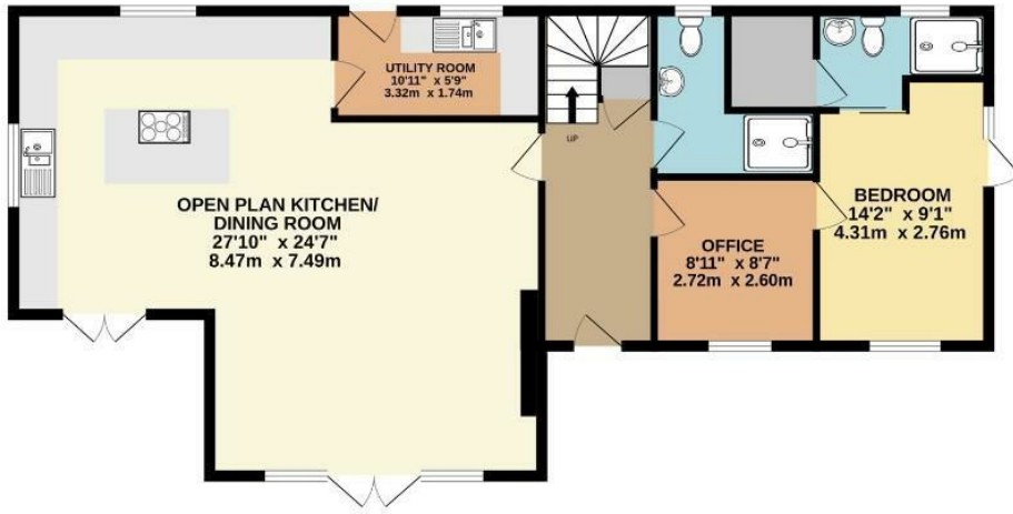
1ST FLOOR 879 sq.ft. (81.7 sq.m.) approx.