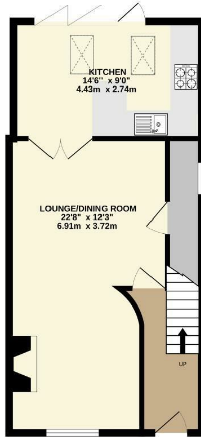
GROUND FLOOR 460 sq.ft. (42.7 sq.m.) approx.