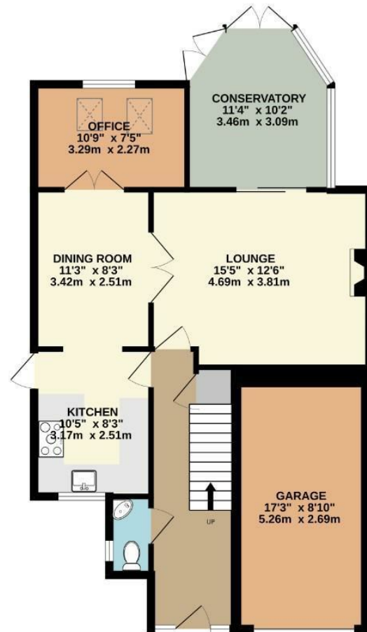
GROUND FLOOR 842 sq.ft. (78.2 sq.m.) approx.