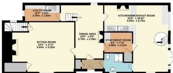
GROUND FLOOR 1221 sq.ft. (112.9 sq.m.) approx.