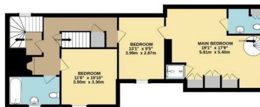
1ST FLOOR 624 sq.ft. (57.5 sq.m.) approx.