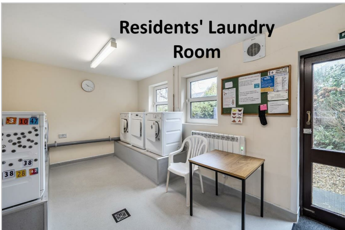
Residents' Laundry Room