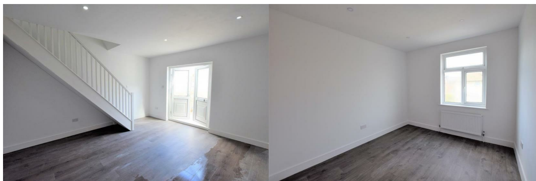
FIRST FLOOR FLAT

Offered freehold this building is arranged over three floors. A commercial unit to the front with a immaculate two bedroom flat situated behind with its own rear garden. On the first you have a three bedroom flat split onto the second floor also offered with private outdoor space with a roof terrace. Currently approximately £36,600 p.a in rental income with the two flats on standard ASTs and the commercial unit on a lease. Call now to arrange your viewing for this rare opportunity.