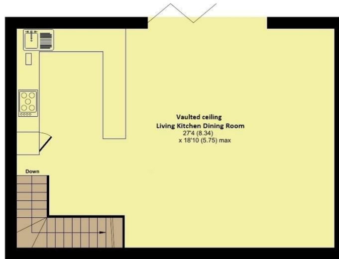
FIRST FLOOR APPROX FLOOR AREA 47.9 SQ M (516 SQ FT)

Floor plan produced in accordance with RICS Property Measurement Standards incorporating International Property Measurement Standards (IPMS2 Residential). © nitchecom 2026. Produced for Hunters Property Group. REF: 1448657