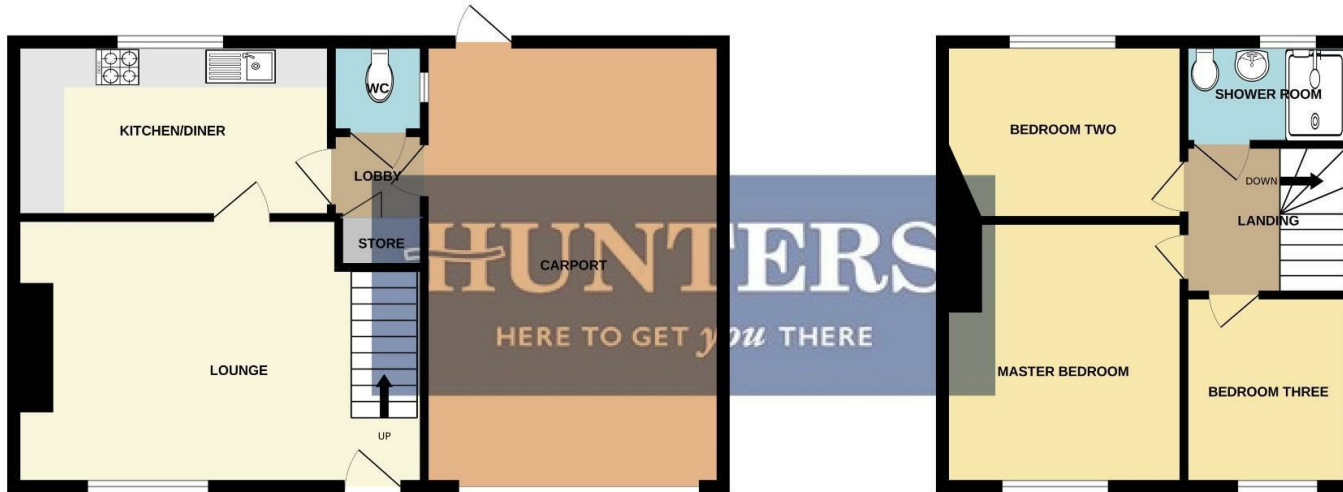
1ST FLOOR 359 sq.ft. (33.3 sq.m.) approx.

TOTAL FLOOR AREA : 984 sq.ft. (91.4 sq.m.) approx. Whilst every attempt has been made to ensure the accuracy of the floorplan contained here, measurements of doors, windows, rooms and any other items are approximate and no responsibility is taken for any error, omission or mis-statement. This plan is for illustrative purposes only and should be used as such by any prospective purchaser. The services, systems and appliances shown have not been tested and no guarantee as to their operability or efficiency can be given. Made with Metropix ©2026