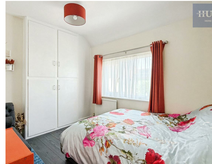
LIVING ROOM 16'5" x 12'6"