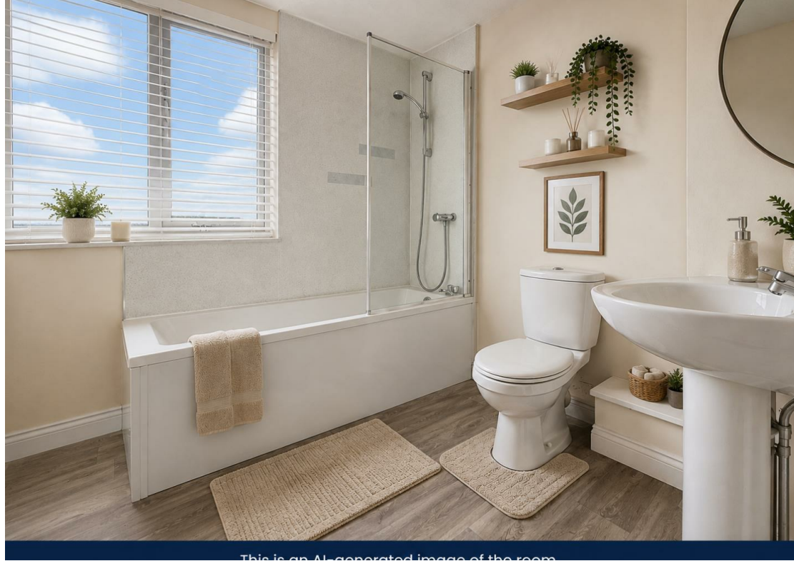
This is an AI-generated image of the room