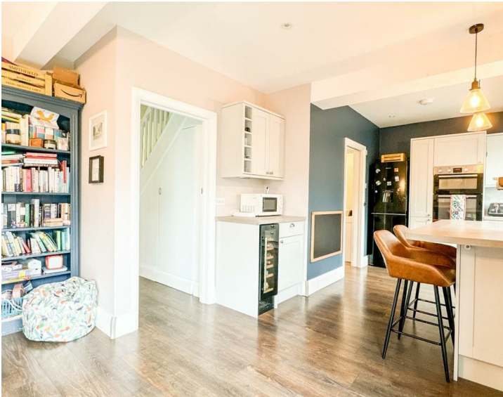
living room 12'0" x 11'7"