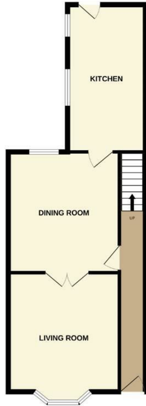
1ST FLOOR 563 sq.ft. (52.3 sq.m.) approx.