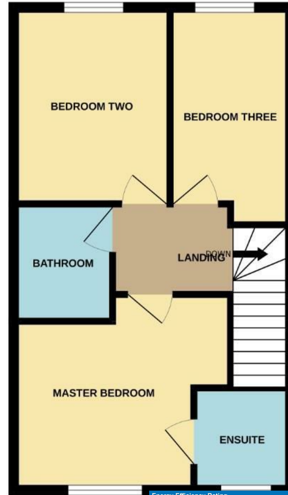
1ST FLOOR 417 sq.ft. (38.8 sq.m.) approx.