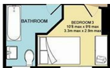
1ST FLOOR APPROX. FLOOR AREA 349 SQ.FT. (32.4 SQ.M.)