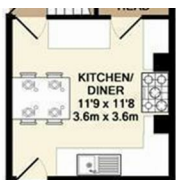
GROUND FLOOR APPROX. FLOOR AREA 322 SQ.FT. (29.9 SQ.M.)

This family property is offered on an part-furnished (white-goods only) basis and briefly comprises; bay-windowed living room with feature gas fire, kitchen with cellar access and equipped with gas range oven, integrated fridge-freezer and ample cupboard space, which in turn overlooks the enclosed rear yard with outhouse, front-facing master bedroom with great under-stair storage, rear-facing large single bedroom and bathroom with shower over bath to the first floor, together with a further double bedroom in the attic with velux windows.