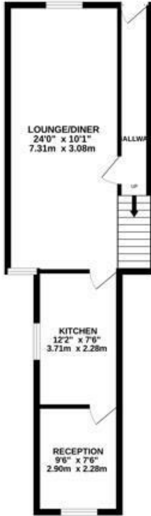
GROUND FLOOR 470 sq.ft (43.6 sq.m) approx.