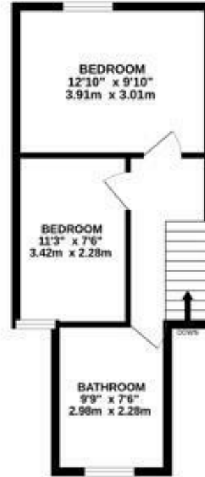
1ST FLOOR 343 sq.ft (31.9 sq.m) approx.