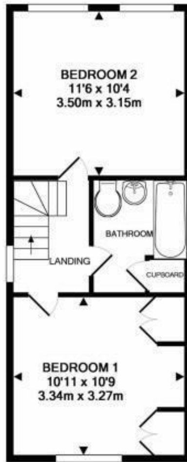
1ST FLOOR APPROX. FLOOR AREA 359 SQ.FT. (33.4 SQ.M.)

TOTAL APPROX. FLOOR AREA 714 SQ.FT. (66.3 SQ.M.)