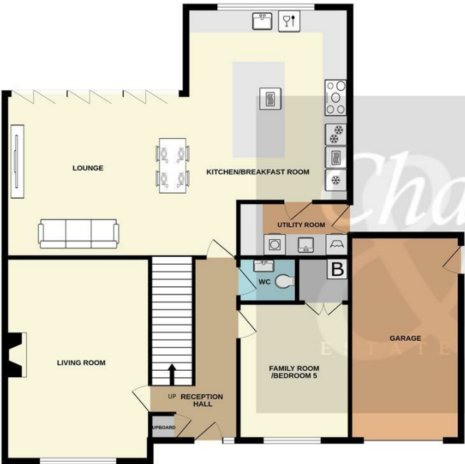
GROUND FLOOR 1086 sq.ft. (100.9 sq.m.) approx.