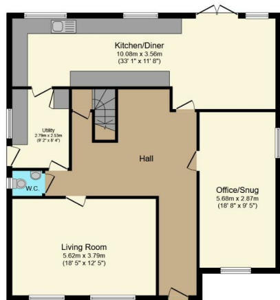
Ground Floor Floor area 108.2 sq.m. (1,165 sq.ft.)